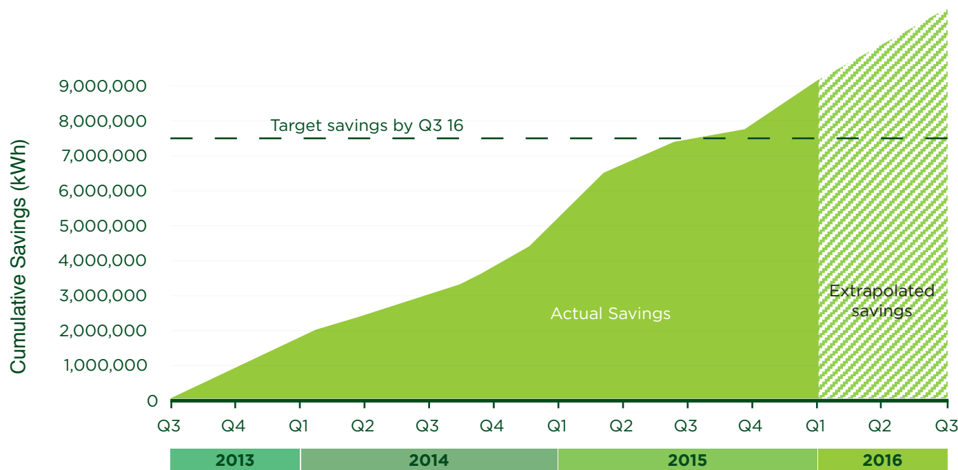
Figure 2. Energy savings exceeding projections

The green dotted line in Figure 2 represents the projected cumulative savings as of Q3 2016 – the target performance for the retrofit measures by this date, and the basis for investment decisions. This project has out-performed projections by a considerable degree, demonstrating that the contractual incentives work.